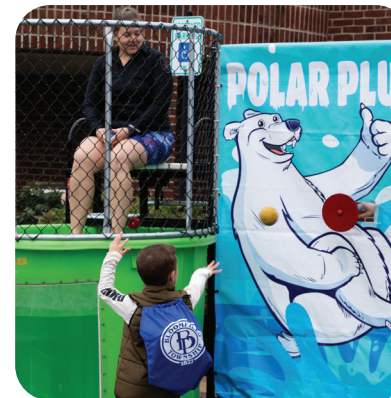
Photo Collage (Clockwise): BTFD Burn Demonstration, The Kat Orlando Duo performs, BTPD Dunk Tank, A child at the live animals.