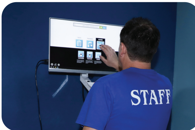
Stretch cage and balance assessments available at Senior Center.

would like a Fire Department representative to conduct a home safety inspection, call (248) 433-7745 during their regular business hours to make an appointment.