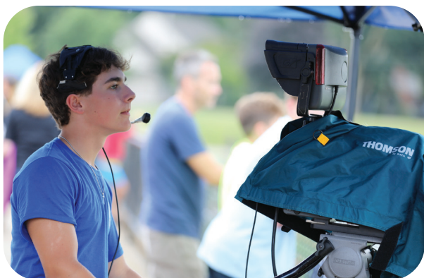
Clockwise from left: Student campers run a television camera, conduct a pre-game interview, and commentate from the press booth on Game Day.